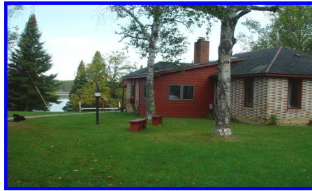
Lakeplace Guest House